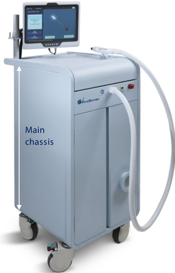
Intuitive Touch Screen